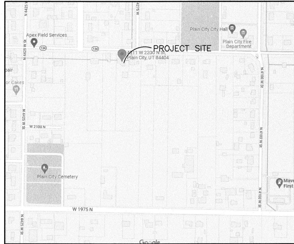
VICINITY MAP SCALE: NONE

PART OF THE SOUTHWEST QUARTER OF SECTION 33, TOWNSHIP 7 NORTH RANGE 2 WEST, SALT LAKE BASE AND MERIDIAN, U.S. SURVEY PART OF LOT 12, PLAT B, PLAIN CITY SURVEY PLAIN CITY, WEBER COUNTY, UTAH JANUARY, 2022